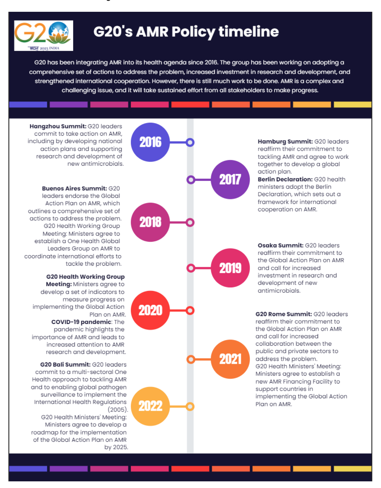
Figure 3: A timeline of G20 commitments on AMR.